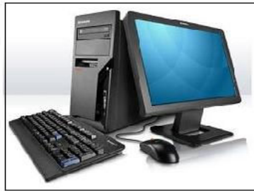
IT support and maintenance